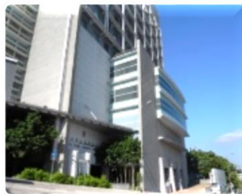
九龍石硤尾 公共衛生檢測中心 Public Health Laboratory Centre Shek Kip Mei, Kowloon