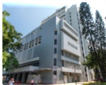
九龍荔枝角 荔枝角政府合署 Lai Chi Kok Government Offices Lai Chi Kok, Kowloon