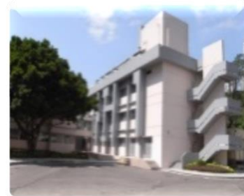
香港薄扶林 食物安全檢測所 Food Safety Laboratory Pok Fu Lam, Hong Kong