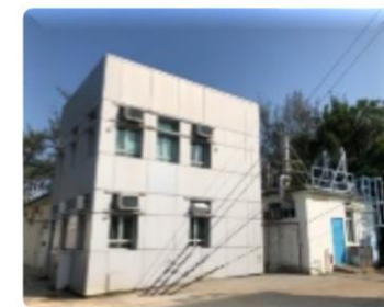
九龍何文田 京士柏氣象站 King's Park Meteorological Station Ho Man Tin, Kowloon