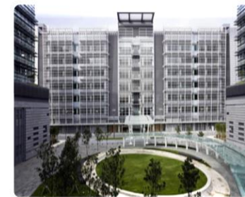
新界沙田 香港科學園 Hong Kong Science Park Sha Tin, New Territories