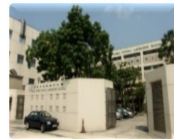
九龍九龍灣 工務中央試驗所大樓 Public Works Central Laboratory Building Kowloon Bay, Kowloon