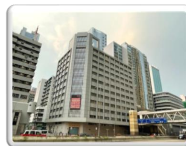
九龍長沙灣實驗室 Laboratory at Cheung Sha Wan, Kowloon